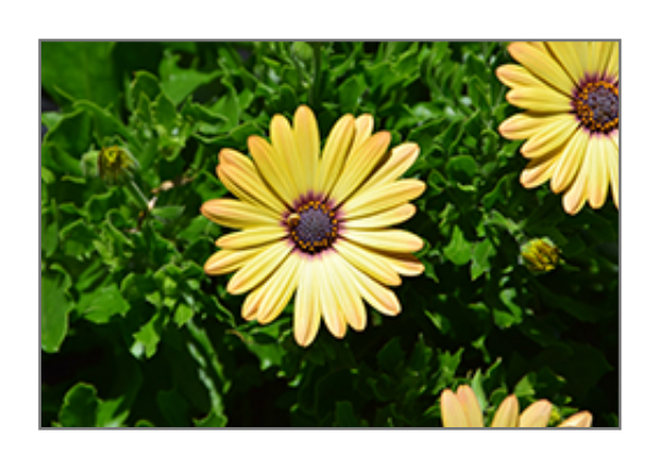
Akila Yellow African Daisy flowers