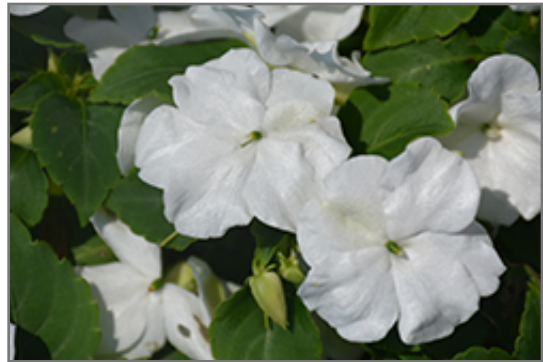
Accent Premium White Impatiens flowers

Accent Premium White Impatiens is recommended for the following landscape applications;