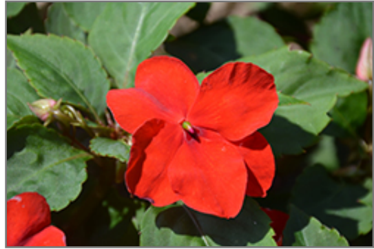
Accent Premium Red Impatiens flowers

Accent Premium Red Impatiens is recommended for the following landscape applications;