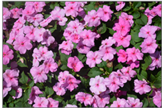
Accent Premium Pink Impatiens flowers