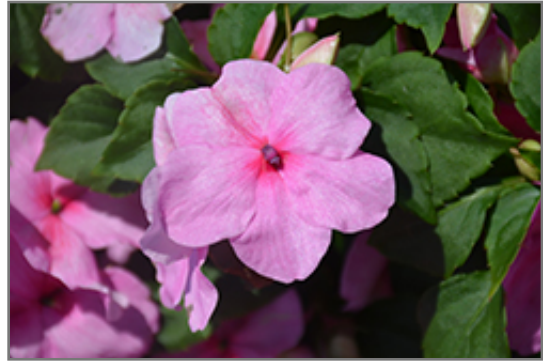
Accent Premium Pink Impatiens flowers

Accent Premium Pink Impatiens is recommended for the following landscape applications;