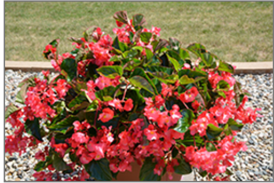
Megawatt Rose Green Leaf Begonia in bloom

Megawatt Rose Green Leaf Begonia is a fine choice for the garden, but it is also a good selection for planting in outdoor containers and hanging baskets. With its upright habit of growth, it is best suited for use as a 'thriller' in the 'spiller-thriller-filler' container combination; plant it near the center of the pot, surrounded by smaller plants and those that spill over the edges. It is even sizeable enough that it can be grown alone in a suitable container. Note that when growing plants in outdoor containers and baskets, they may require more frequent waterings than they would in the yard or garden.