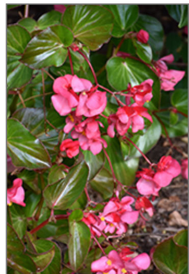
Megawatt Rose Green Leaf Begonia flowers