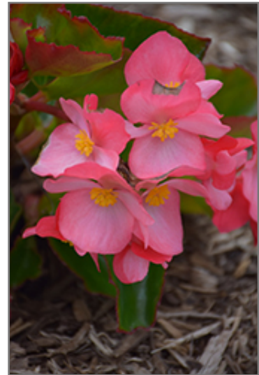
Megawatt Rose Green Leaf Begonia flowers