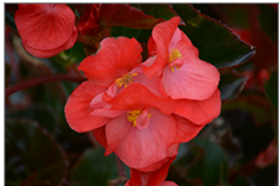
Megawatt Red Bronze Leaf Begonia flowers