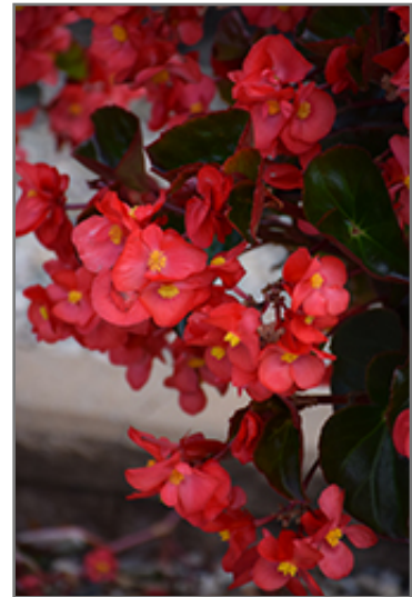
Megawatt Red Bronze Leaf Begonia flowers

Megawatt Red Bronze Leaf Begonia is an herbaceous evergreen perennial with an upright spreading habit of growth. Its medium texture blends into the garden, but can always be balanced by a couple of finer or coarser plants for an effective composition.