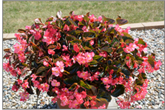
Megawatt Pink Bronze Leaf Begonia in bloom