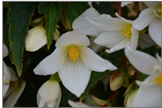
Beauvilia White Begonia flowers