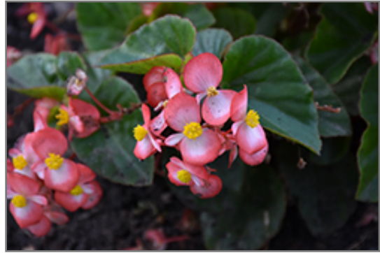
BabyWing Pink Bicolor Begonia flowers

BabyWing Pink Bicolor Begonia is recommended for the following landscape applications;