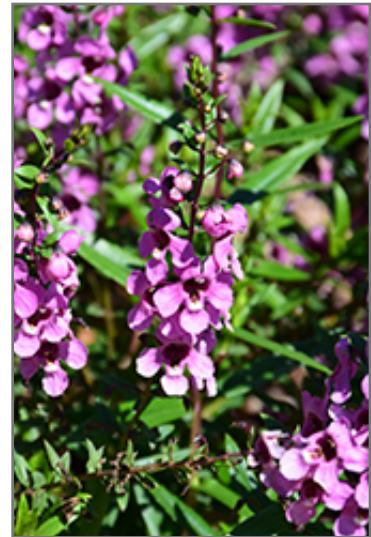
Sungelonia Pink Angelonia flowers

Sungelonia Pink Angelonia is recommended for the following landscape applications;