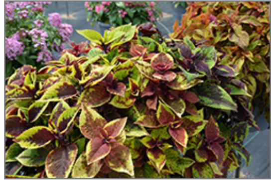
Premium Sun Pineapple Surprise Coleus

Premium Sun Pineapple Surprise Coleus will grow to be about 24 inches tall at maturity, with a spread of 20 inches. When grown in masses or used as a bedding plant, individual plants should be spaced approximately 18 inches apart. It grows at a fast rate, and under ideal conditions can be expected to live for approximately 5 years. As an evergreen perennial, this plant will typically keep its form and foliage year-round.