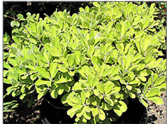
Nana Pittosporum