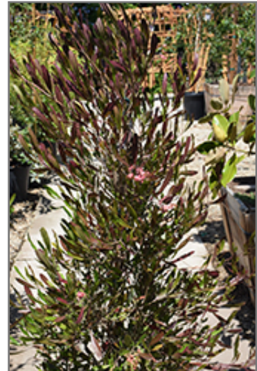
Purple Hop Bush