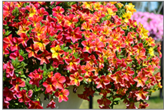
Aloha Nani Red Cartwheel Calibrachoa flowers

Aloha Nani Red Cartwheel Calibrachoa is recommended for the following landscape applications;