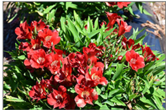
Colorita Kate Alstroemeria in bloom