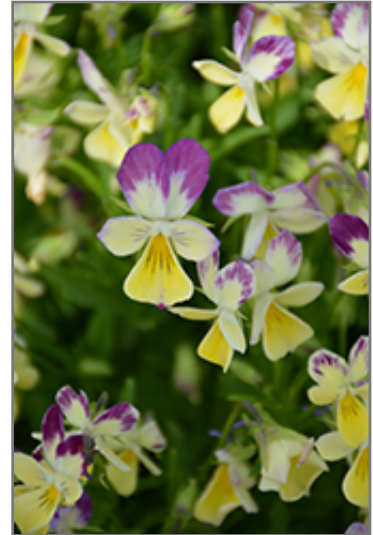
Hip Hop Honeybunny Pansy flowers