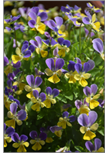
Hip Hop Bluebunny Pansy flowers