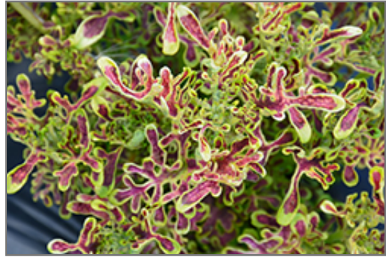
Under The Sea Red Coral Coleus foliage

Under The Sea Red Coral Coleus is recommended for the following landscape applications;