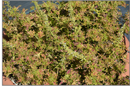
Under The Sea Red Coral Coleus foliage

Under The Sea Red Coral Coleus will grow to be about 20 inches tall at maturity, with a spread of 24 inches. When grown in masses or used as a bedding plant, individual plants should be spaced approximately 20 inches apart. It grows at a fast rate, and under ideal conditions can be expected to live for approximately 5 years. As an evergreen perennial, this plant will typically keep its form and foliage year-round.