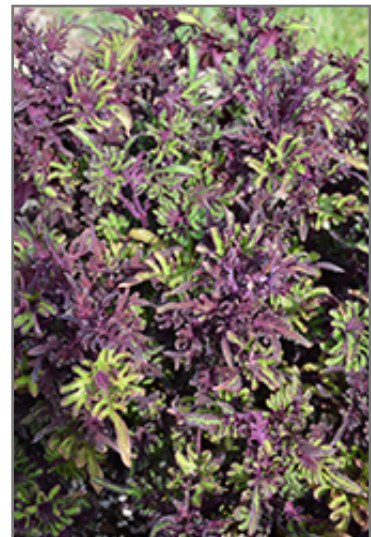
Under The Sea Lime Shrimp Coleus foliage