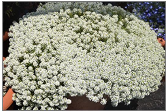
Snow Globe Alyssum in bloom