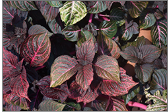
Brilliantissima Blood Leaf foliage