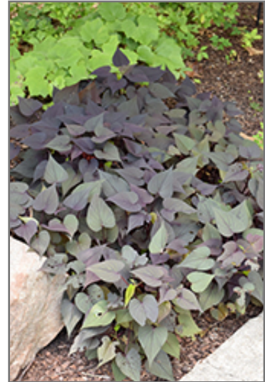
Sweet Georgia Heart Purple Sweet Potato Vine