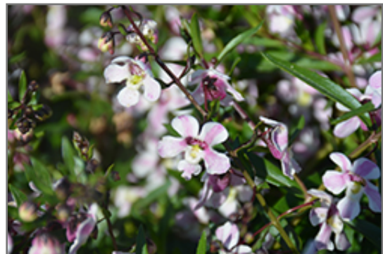
Pinstripe Vintage Pink Angelonia flowers