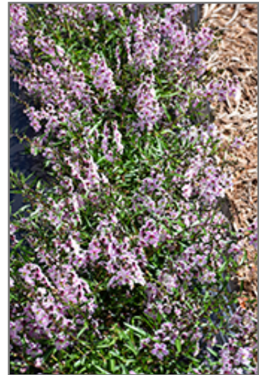
Pinstripe Vintage Pink Angelonia in bloom

Pinstripe Vintage Pink Angelonia is a fine choice for the garden, but it is also a good selection for planting in outdoor containers and hanging baskets. It is often used as a 'filler' in the 'spiller-thriller-filler' container combination, providing a mass of flowers against which the larger thriller plants stand out. Note that when growing plants in outdoor containers and baskets, they may require more frequent waterings than they would in the yard or garden.