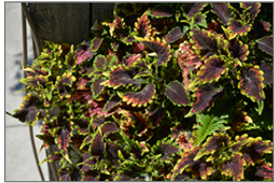
Sky Fire Coleus foliage

Sky Fire Coleus is recommended for the following landscape applications;