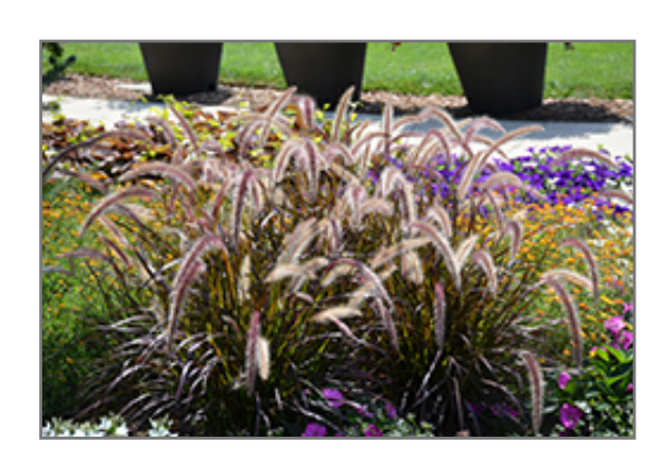
Red Riding Hood Purple Fountain Grass in bloom