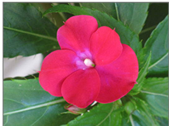
Infinity Cherry Red New Guinea Impatiens flowers