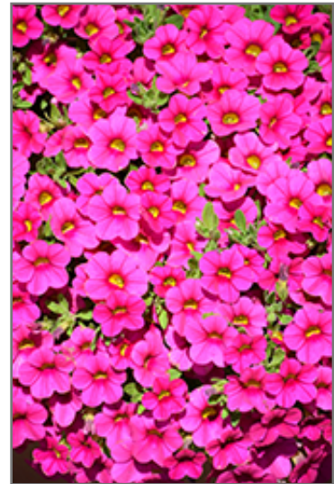
Million Bells Compact Brilliant Pink Calibrachoa flowers

This plant will require occasional maintenance and upkeep. Trim off the flower heads after they fade and die to encourage more blooms late into the season. It is a good choice for attracting bees and hummingbirds to your yard, but is not particularly attractive to deer who tend to leave it alone in favor of tastier treats. It has no significant negative characteristics.