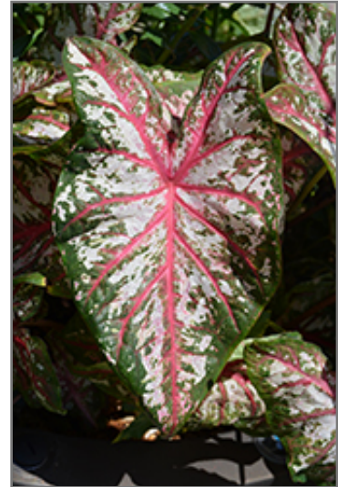
Artful Fire and Ice Caladium foliage