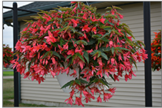
Bossa Nova Pink Glow Begonia in bloom

Bossa Nova Pink Glow Begonia is a fine choice for the garden, but it is also a good selection for planting in outdoor containers and hanging baskets. Because of its trailing habit of growth, it is ideally suited for use as a 'spiller' in the 'spiller-thriller-filler' container combination; plant it near the edges where it can spill gracefully over the pot. Note that when growing plants in outdoor containers and baskets, they may require more frequent waterings than they would in the yard or garden.