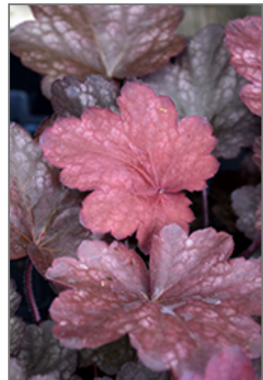
Carnival Candy Apple Coral Bells foliage