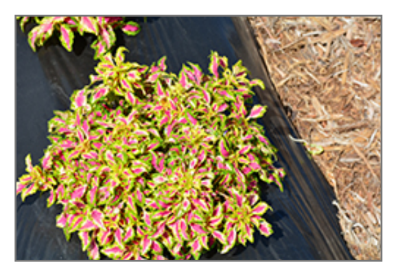
Terra Nova Magic Spell Coleus

This is a relatively low maintenance plant. The flowers of this plant may actually detract from its ornamental features, so they can be removed as they appear. Deer don't particularly care for this plant and will usually leave it alone in favor of tastier treats. It has no significant negative characteristics.