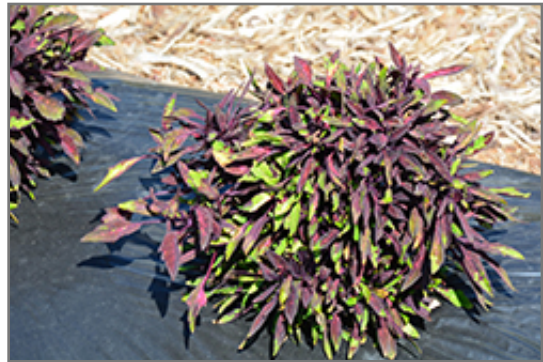
Fancy Feathers Black Coleus