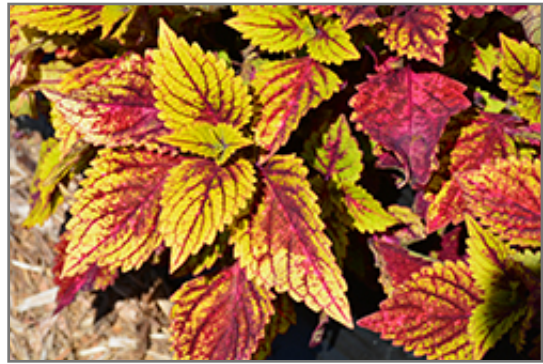
Color Clouds Hottie Coleus foliage

Color Clouds Hottie Coleus is recommended for the following landscape applications;