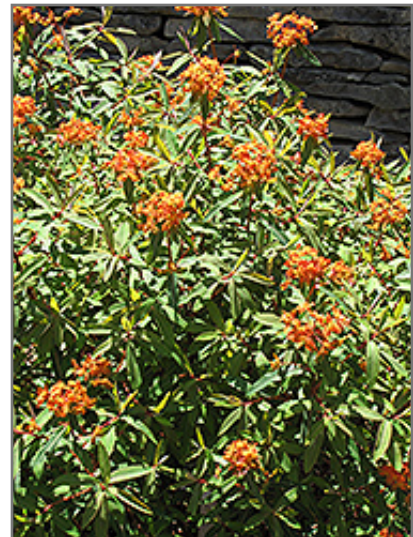
Fireglow Spurge in bloom