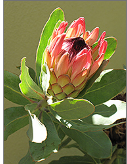
Sylvia Protea flowers