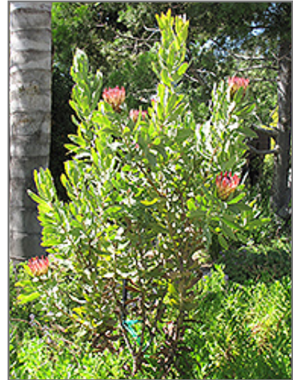
Sylvia Protea in bloom

This shrub should only be grown in full sunlight. It is very adaptable to both dry and moist growing conditions, but will not tolerate any standing water. It is not particular as to soil type, but has a definite preference for acidic soils. It is somewhat tolerant of urban pollution, and will benefit from being planted in a relatively sheltered location. Consider applying a thick mulch around the root zone in winter to protect it in exposed locations or colder microclimates. This particular variety is an interspecific hybrid.