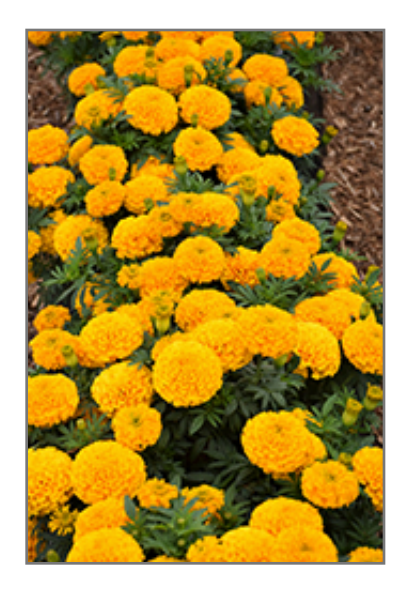
Taishan Gold Marigold flowers