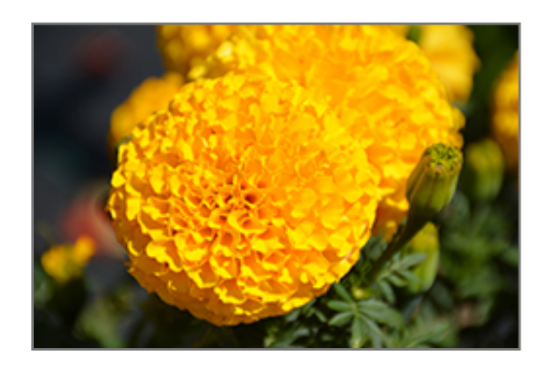
Taishan Gold Marigold flowers

2301 San Joaquin Hills Rd. Corona del Mar, CA 92625 phone: 949.640.5800 www.rogersgardens.com