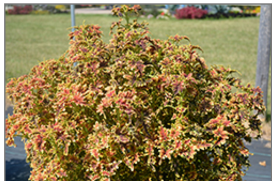
Under The Sea Copper Coral Coleus