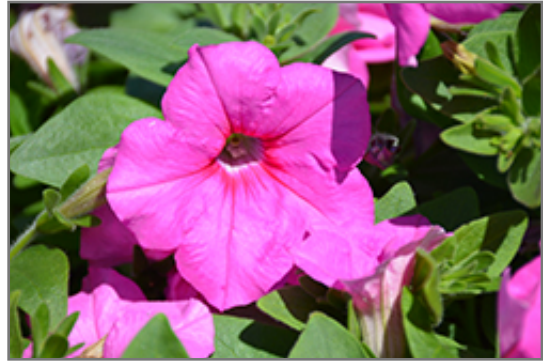
Easy Wave Pink Passion Petunia flowers

Easy Wave Pink Passion Petunia is recommended for the following landscape applications;