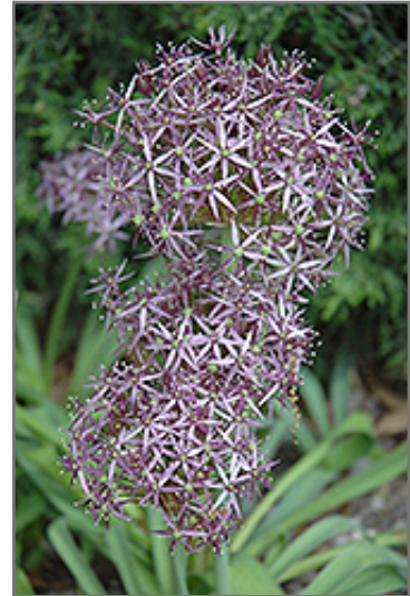
Star Of Persia Onion flowers