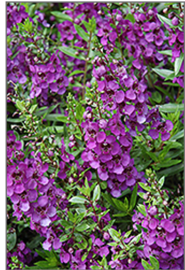
Archangel Dark Purple Angelonia flowers

Archangel Dark Purple Angelonia is recommended for the following landscape applications;