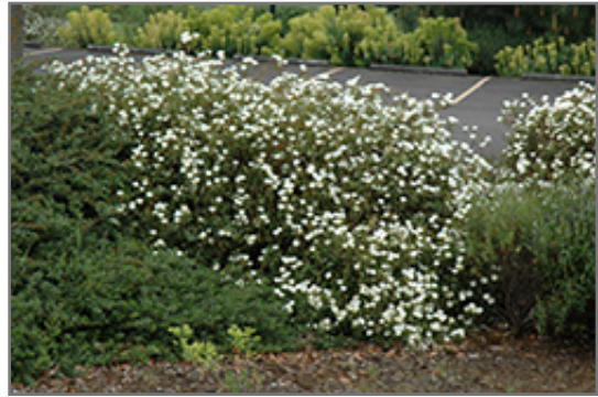
White Rockrose in bloom