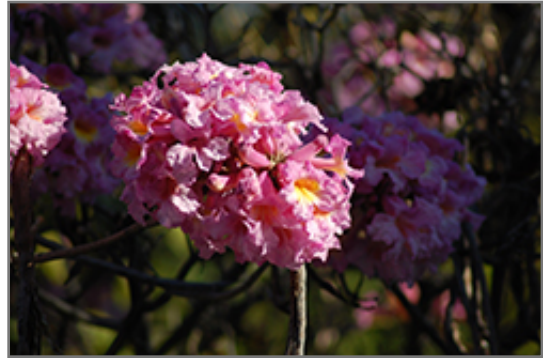
Pink Trumpet Tree flowers

Pink Trumpet Tree is recommended for the following landscape applications;