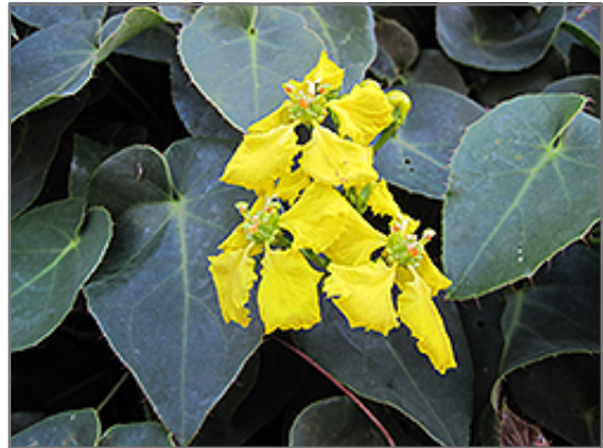
Orchid Vine flowers