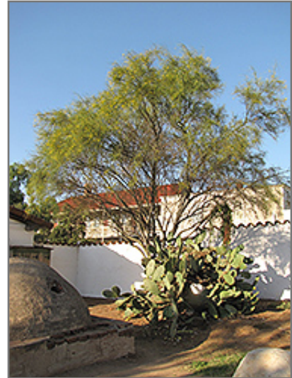
Mexican Palo Verde in bloom

Mexican Palo Verde is recommended for the following landscape applications;