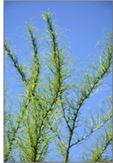
Mexican Palo Verde foliage

Mexican Palo Verde is a fine choice for the yard, but it is also a good selection for planting in outdoor pots and containers. Its large size and upright habit of growth lend it for use as a solitary accent, or in a composition surrounded by smaller plants around the base and those that spill over the edges. It is even sizeable enough that it can be grown alone in a suitable container. Note that when grown in a container, it may not perform exactly as indicated on the tag - this is to be expected. Also note that when growing plants in outdoor containers and baskets, they may require more frequent waterings than they would in the yard or garden.