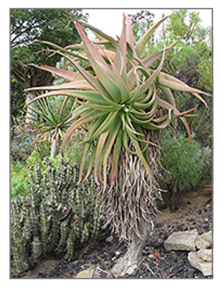
Tilt-head Aloe

2301 San Joaquin Hills Rd. Corona del Mar, CA 92625 phone: 949.640.5800 www.rogersgardens.com