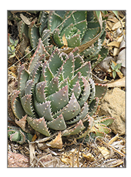
Short-leaved Aloe

Short-leaved Aloe is recommended for the following landscape applications;