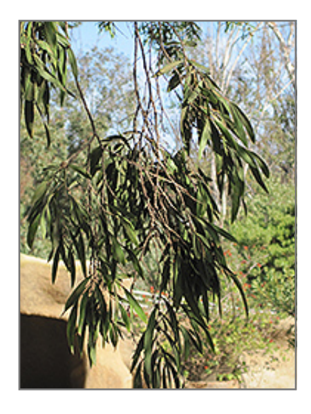
Peppermint Tree foliage

Peppermint Tree is a fine choice for the yard, but it is also a good selection for planting in outdoor pots and containers. Because of its height, it is often used as a 'thriller' in the 'spiller-thriller-filler' container combination; plant it near the center of the pot, surrounded by smaller plants and those that spill over the edges. It is even sizeable enough that it can be grown alone in a suitable container. Note that when grown in a container, it may not perform exactly as indicated on the tag - this is to be expected. Also note that when growing plants in outdoor containers and baskets, they may require more frequent waterings than they would in the yard or garden.