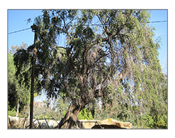
Peppermint Tree