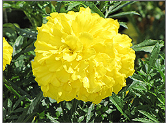
Jubilee Diamond Marigold flowers