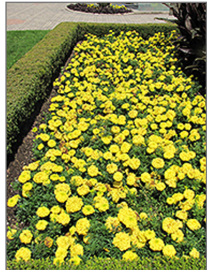
Jubilee Diamond Marigold in bloom