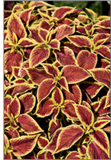
Premium Sun Crimson Gold Coleus foliage

Premium Sun Crimson Gold Coleus is recommended for the following landscape applications;