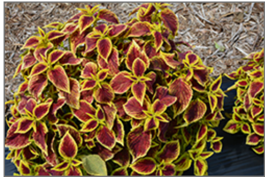
Premium Sun Crimson Gold Coleus