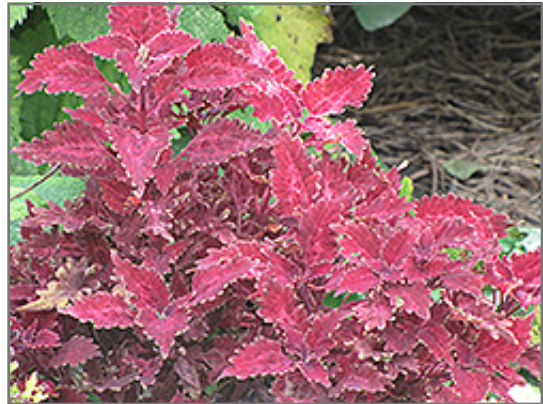
Cranberry Sun Coleus foliage